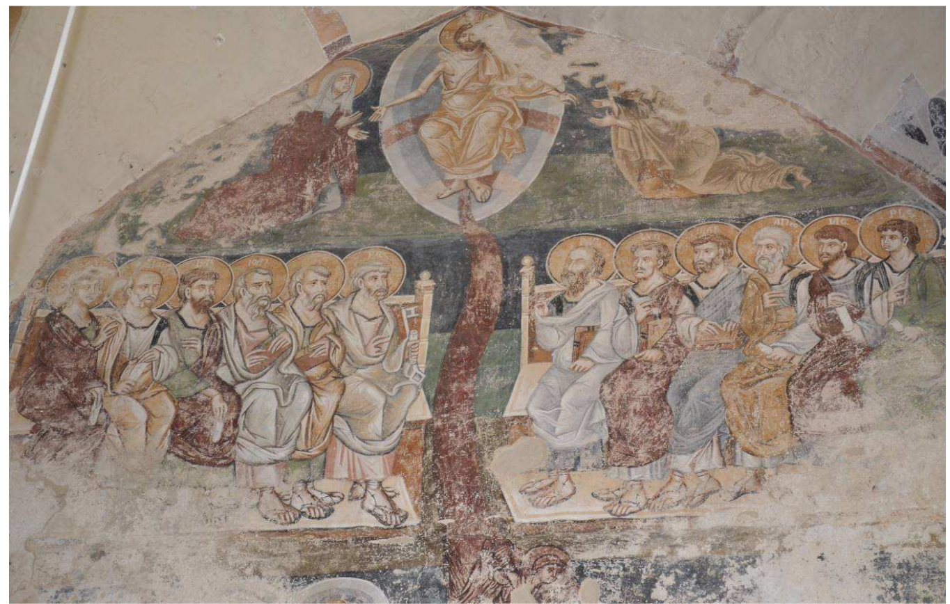
Last Judgment, mural painting in the church at Dârlos, Sibiu district

Based on a comparative analysis of Luther's Small Catechism, Transylvanian Church Orders, the decrees of the synods of the Lutheran Church and guild statutes, this paper discussed definitions of sin within the Saxon community of Early Modern Transylvania. On the one hand, the study assessed whether Transylvanian reformers found inspiration in Luther's Catechism when defining sin and various types of transgressions which offended God or the community of faithful. On the other, the essay assessed whether the laity, particularly artisans appealed to the definitions of the clergy or to the long-held values and customs of the group when classifying and punishing offences. Such an analysis is helpful for understanding the definitions of sin devised by various institutions (the Lutheran Church, town councils, and the guilds) involved in religious and social disciplining.