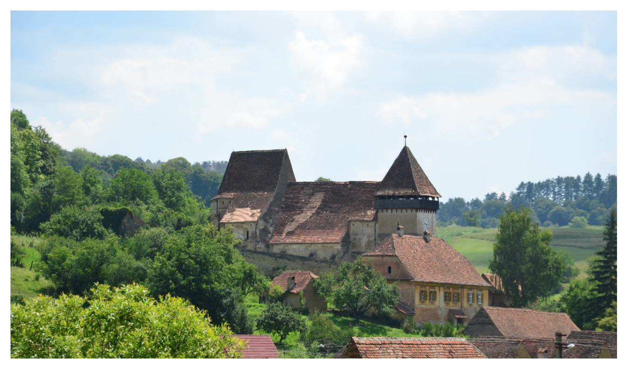
The fortified church of Copşa Mare