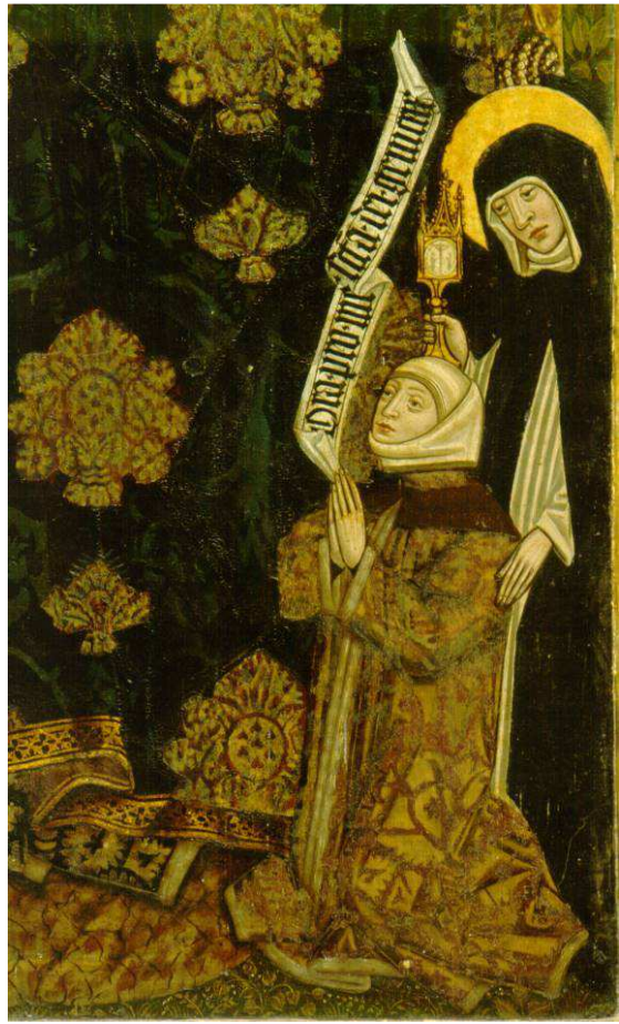
The altarpiece of Mălâncrav, the donor Clara Appafi (Macedoniai)

During the days dedicated to Cluj academia Ciprian Firea will present a paper entitled Female donors of "art" in late medieval Transylvania