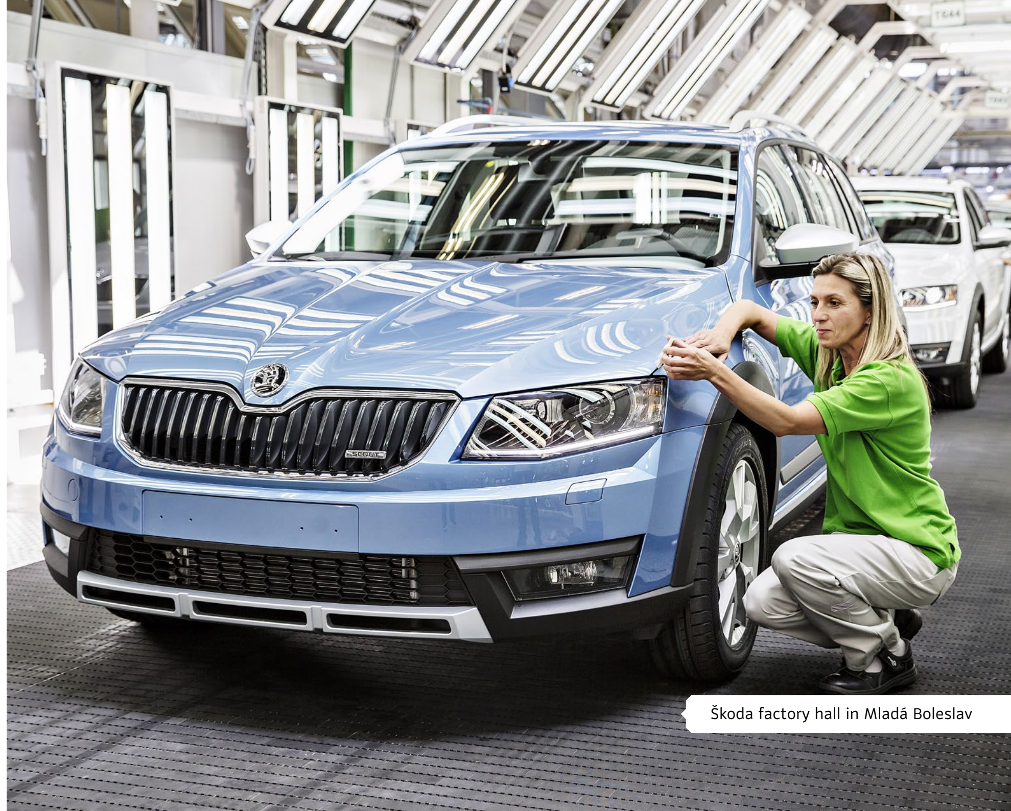
Škoda factory hall in Mladá Boleslav

In the middle of this colourful mosaic lies the town of Hradec Králové with its young and budding university. Czechia was built upon three historic provinces, namely Bohemia , Moravia and Silesia , with Hradec Králové situated in Bohemia near Prague. Only some 100 km (62 miles) is between the capital city and our charming Eastern Bohemia metropolis which is pleasant to live, work and study in. Journey by comfortable bus takes about hour and a quarter, operated on regular basis, as well as the direct train connection reaching Prague Main Train Station in 100 minute's time. Using the motorway the journey take less than an hour, with the International airport Václav Havel at Prague-Ruzyně accessible by additional half of hour of driving.