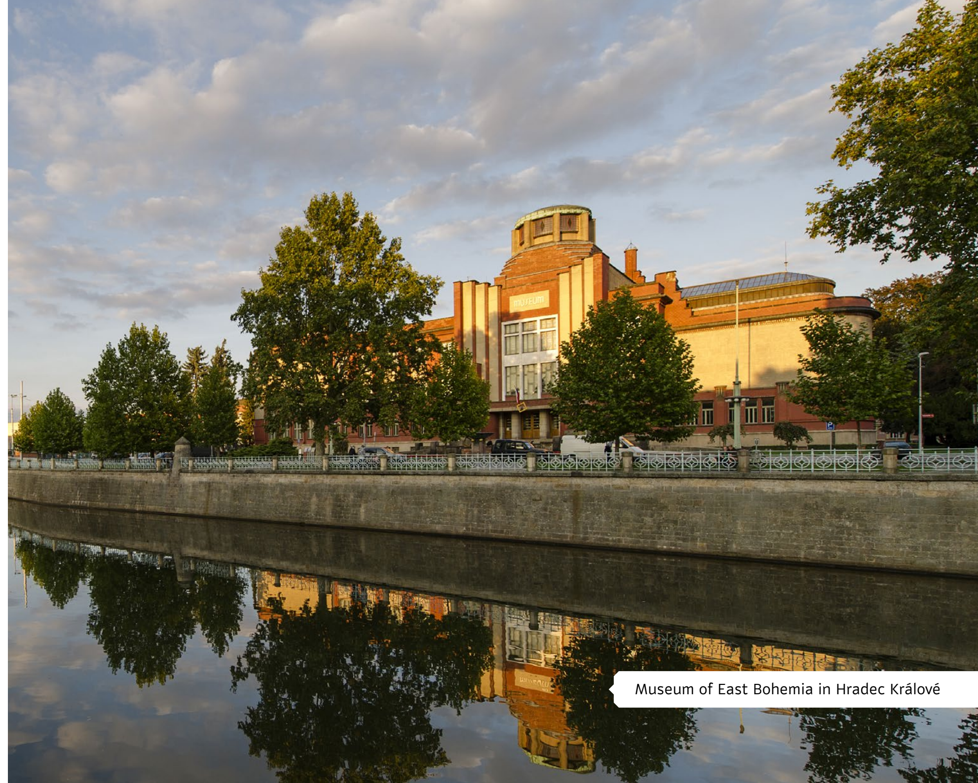
Museum of East Bohemia in Hradec Králové

its urbanistic value and widely referred to as the Salon of the Republic (Salon republiky), are in particular the buildings of the Museum of East Bohemia (Muzeum východních Čech) created by architect Jan Kotěra, respected founder of Czech modern architecture, and then the purposefully austere building of the priest Ambrose congregation , built by Kotěra's pupil and successor Josef Gočár. Hradec Králové gives thanks to these architectural achievements, characterized by high aesthetics and elegance , and makes a positive imprint on the quality of life ; and carrying almost a festive feeling within its streets. We are sure you will agree once you will know the city personally.