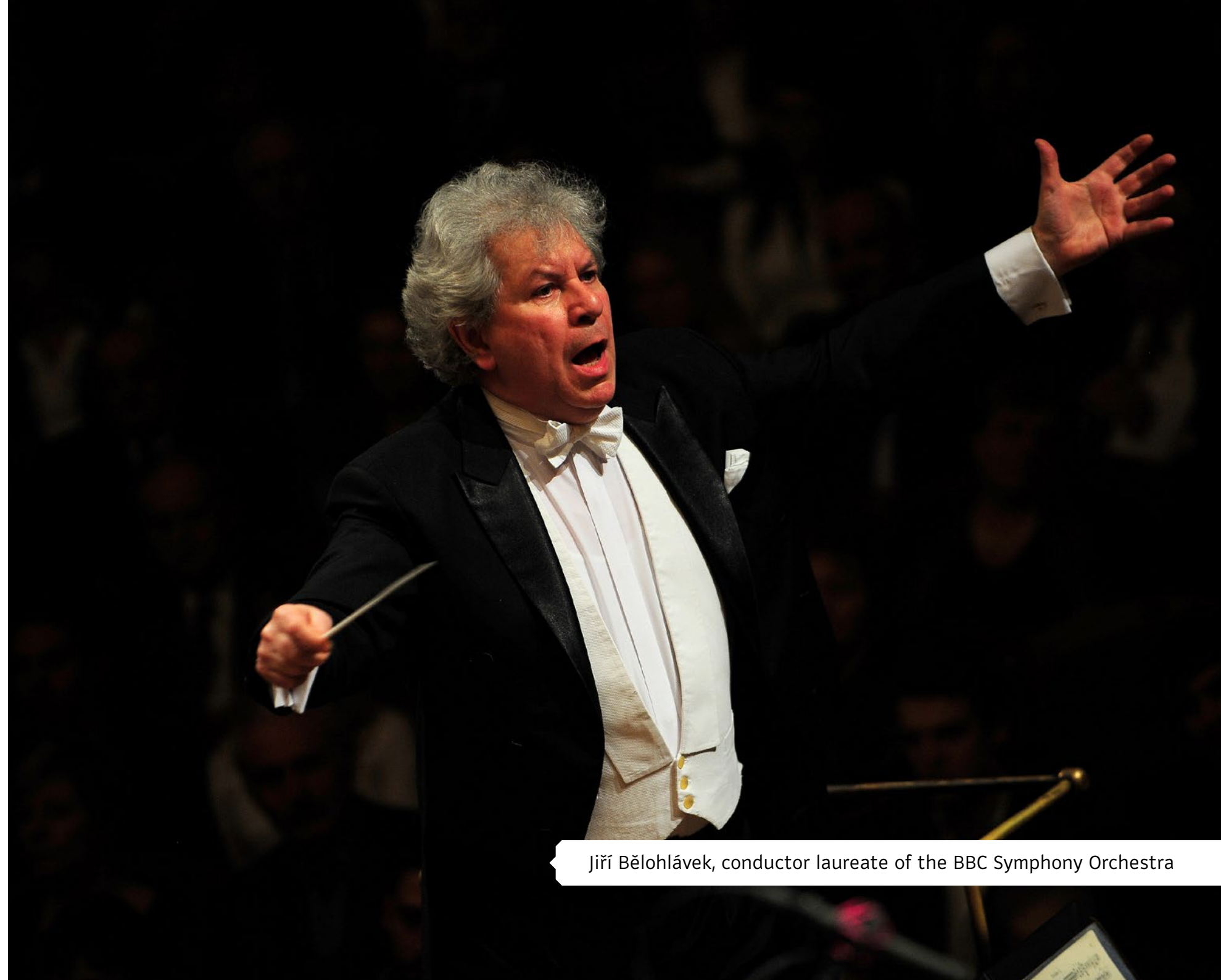
Jiří Bělohlávek, conductor laureate of the BBC Symphony Orchestra

that friar Gregor Johann Mendel (1822–1834), who in the Augustinian monastery in Brno discovered the very idea of the genetics using pea plants, setting foundations for an entire scientific discipline? At the beginning of the 20th century, the world renowned inventor Otto Wichterle (1913–1998) invented and developed eye contact lenses , and Jaroslav Heyrovský (1890–1967) won in 1959 the Nobel Prize in chemistry for the discovery and development of the polarographic method of analysis . You simply cannot avoid the Czech spirit of creativity! A propos, the world famous word robot coined writer Karel Čapek (1890–1938) in his fictional drama RUR (Rossum's Universal Robots), a term that refers to an artificial intelligent working machine. It first came to life on the stage in 1920, quickly adapted by a number of other languages.