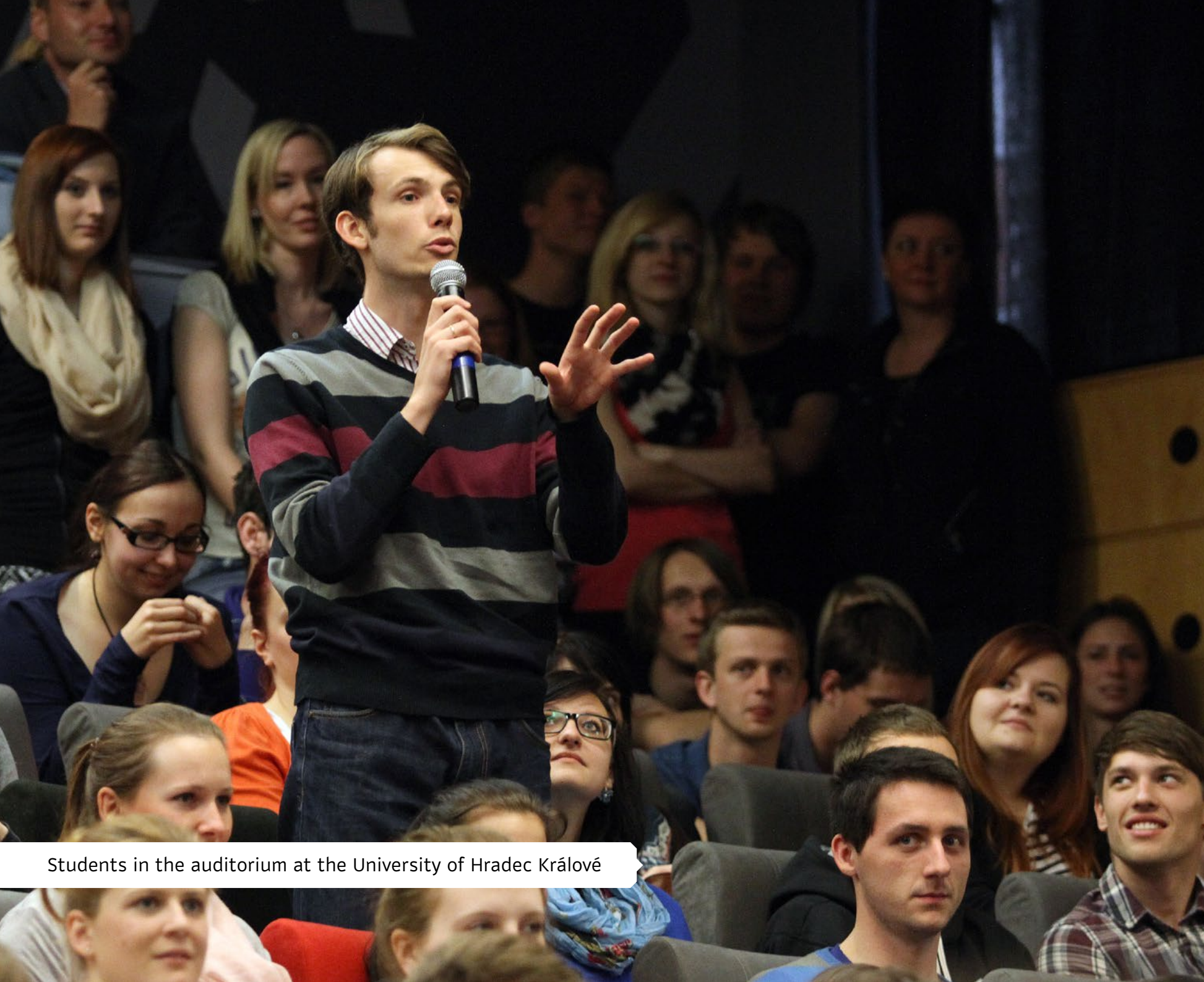
Students in the auditorium at the University of Hradec Králové

students and teachers to establish personal contact, which helps to discover each pupil's individual needs and set specific learning targets according to the student's performance and the chosen specialization.