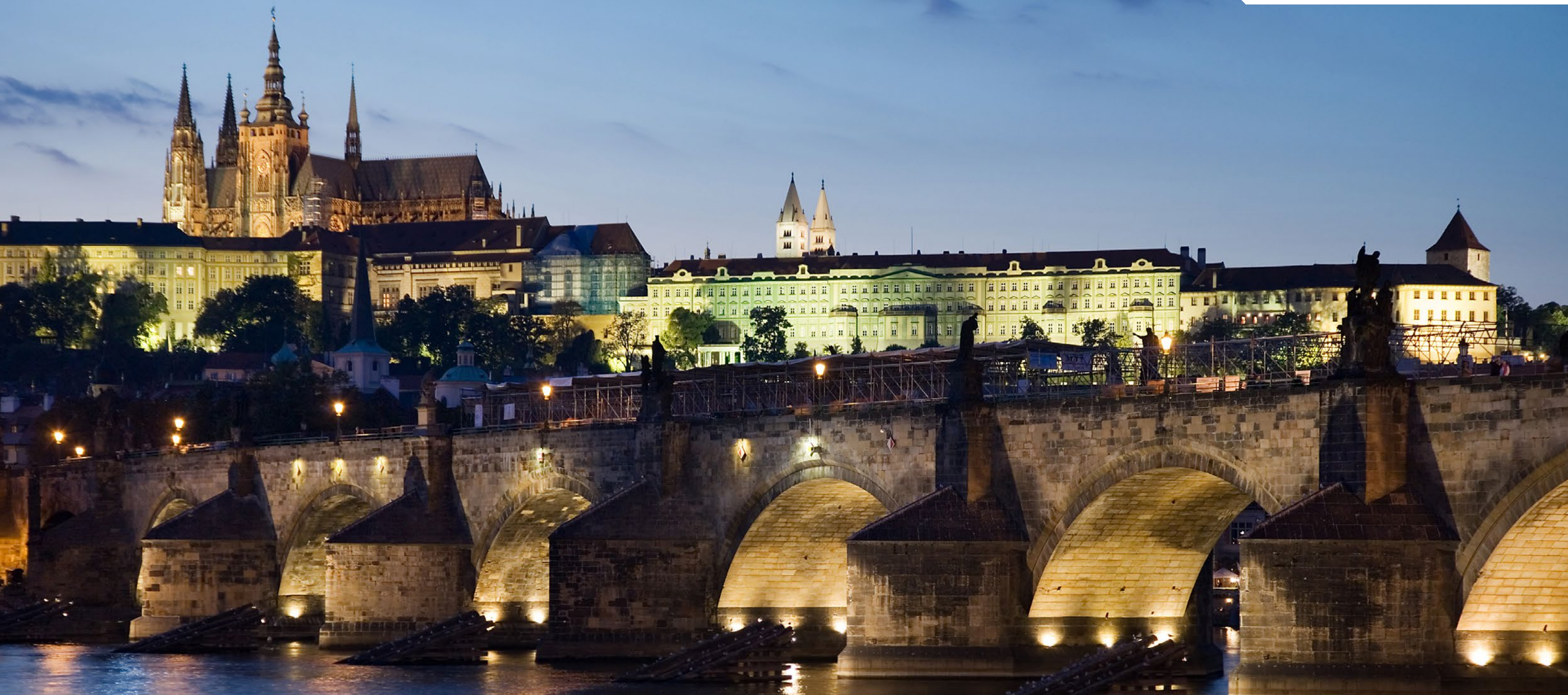
Prague Castle and the Charles Bridge