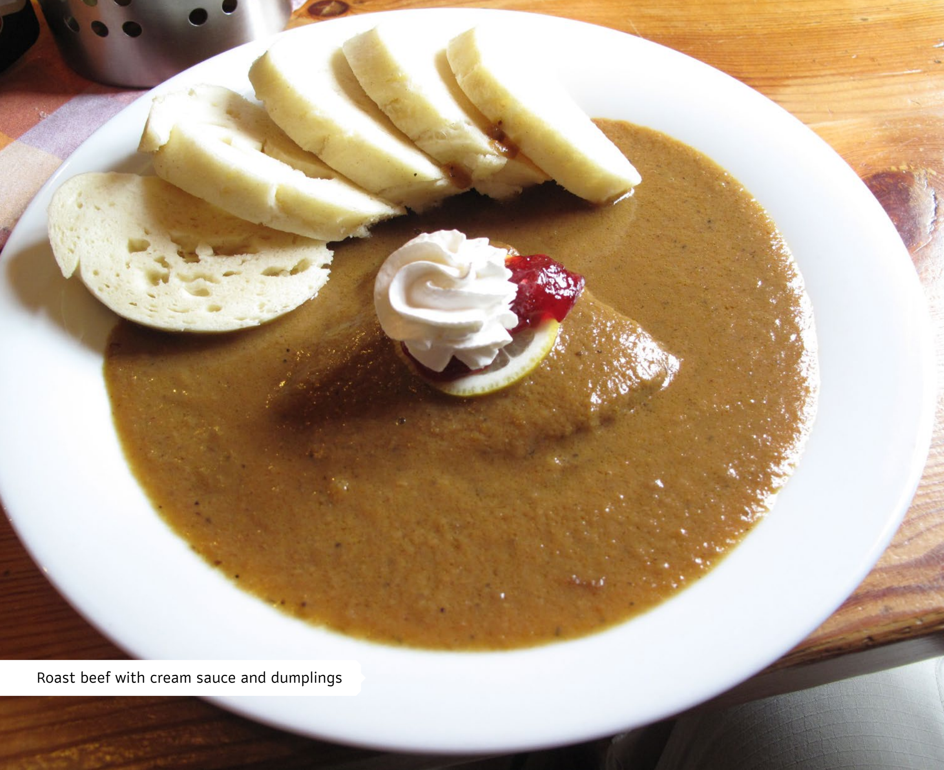
Roast beef with cream sauce and dumplings

uniquely-shaped dark green bottle with a yellow label. This favourite export item and souvenir is made according to an old secret recipe, from a mixture of more than twenty herbs, thus widely consumed for invigorating and therapeutic effects. No wonder that in the most famous Czech spa Carlsbad (Karlový Vary) Becherovka is referred to as the thirteenth natural spring.