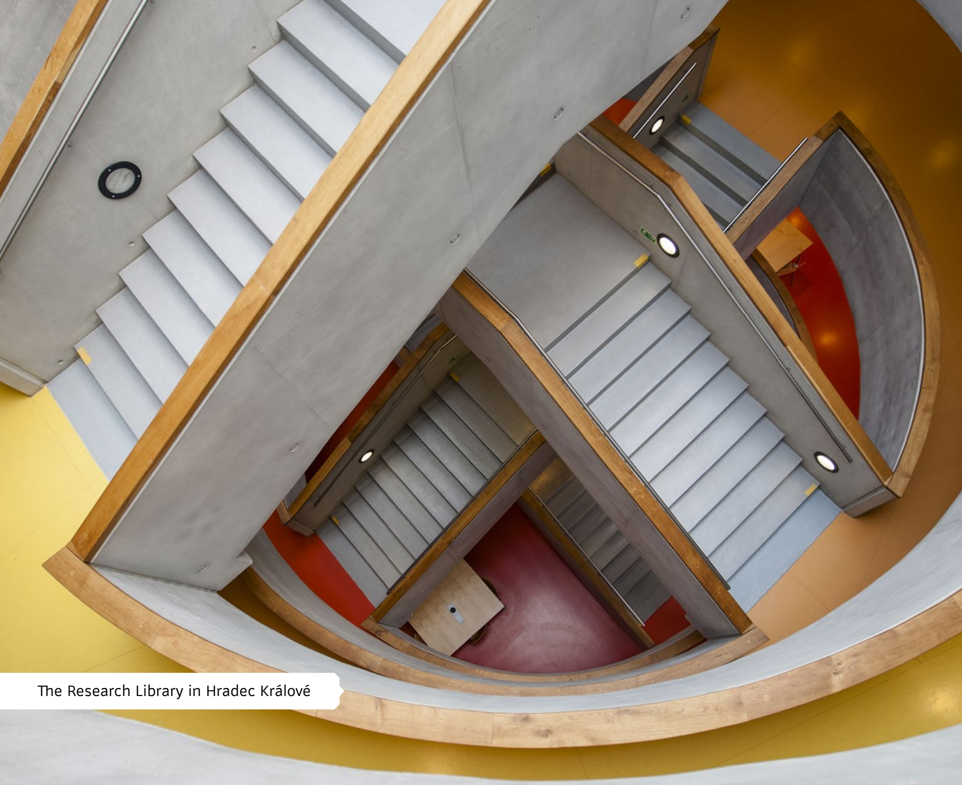
The Research Library in Hradec Králové