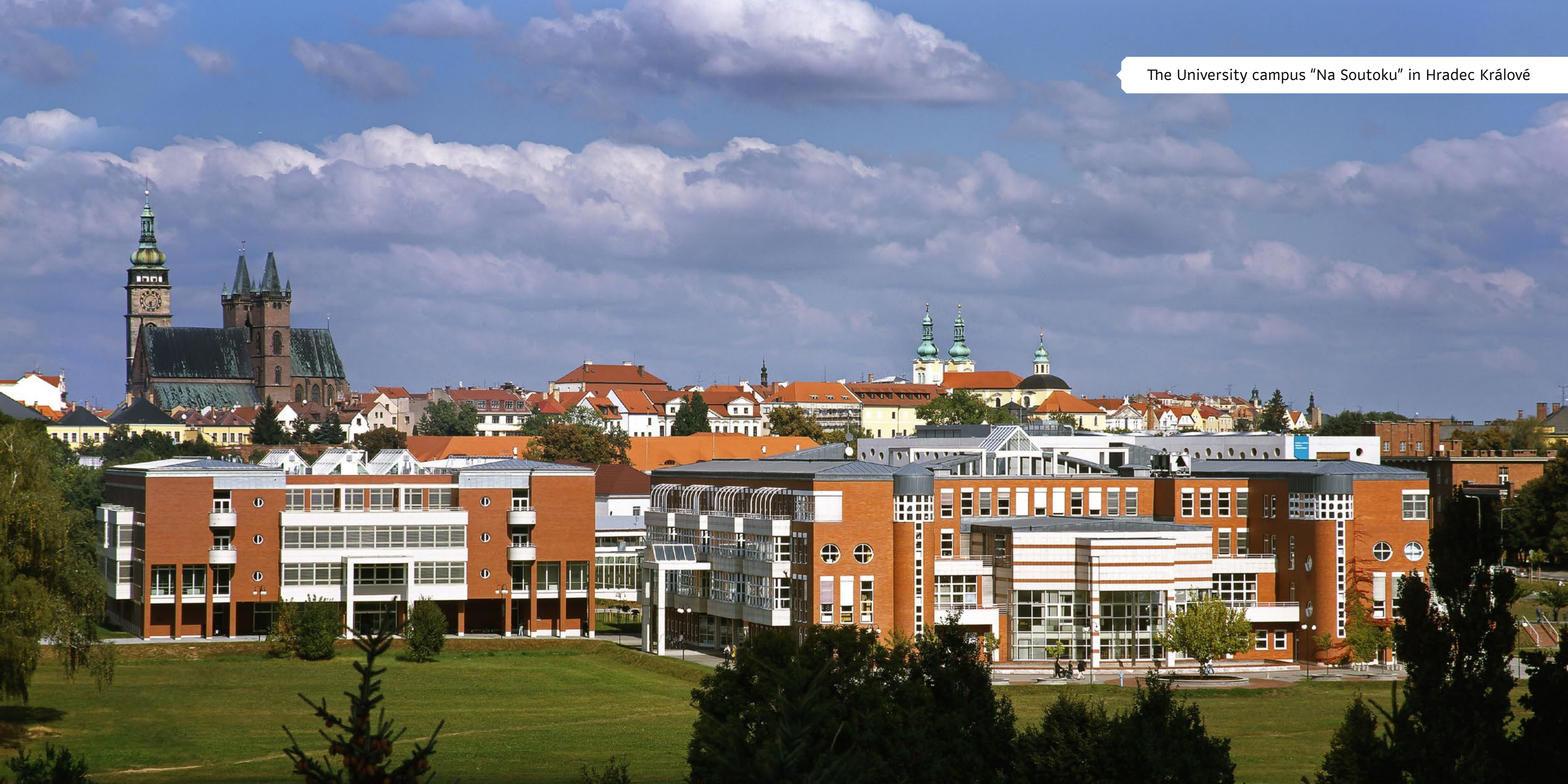
The University campus "Na Soutoku" in Hradec Králové