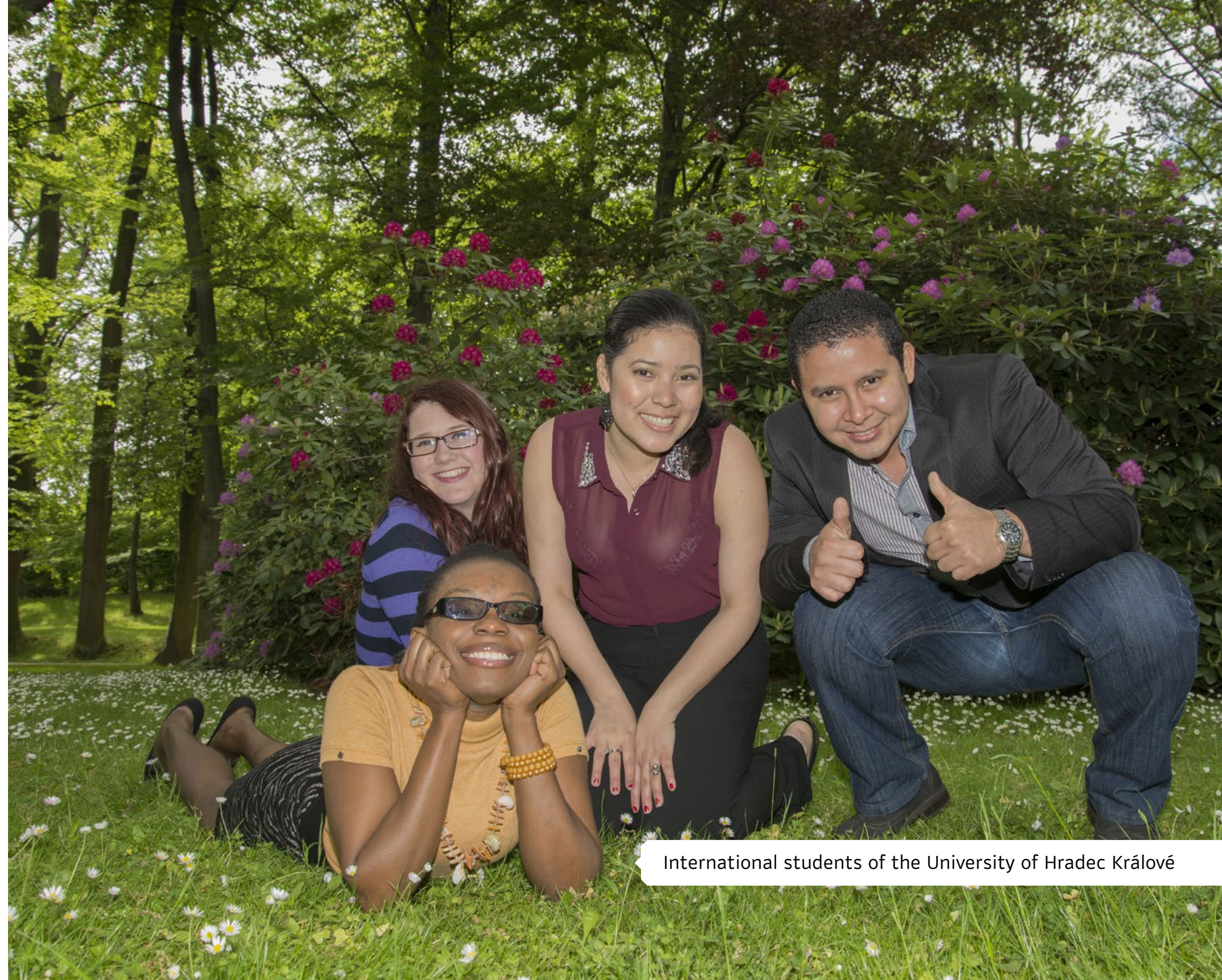
International students of the University of Hradec Králové

There is top-quality medical care easily accessible throughout the whole country, with the population properly vaccinated against basic infectious diseases. Every student or employee can reach first-class help, whether it is a consultation with a qualified general practitioner or more complex medical treatment, free for EU citizens. Clean drinking water is easily accessible from the public conduit. As in most European countries, electrical appliances in Czechia use the single-phase power supply via two pins plug . All other questions related to everyday life in Czechia will be gladly answered by our international office before your arrival. Please find list of contacts in the last section of this booklet.