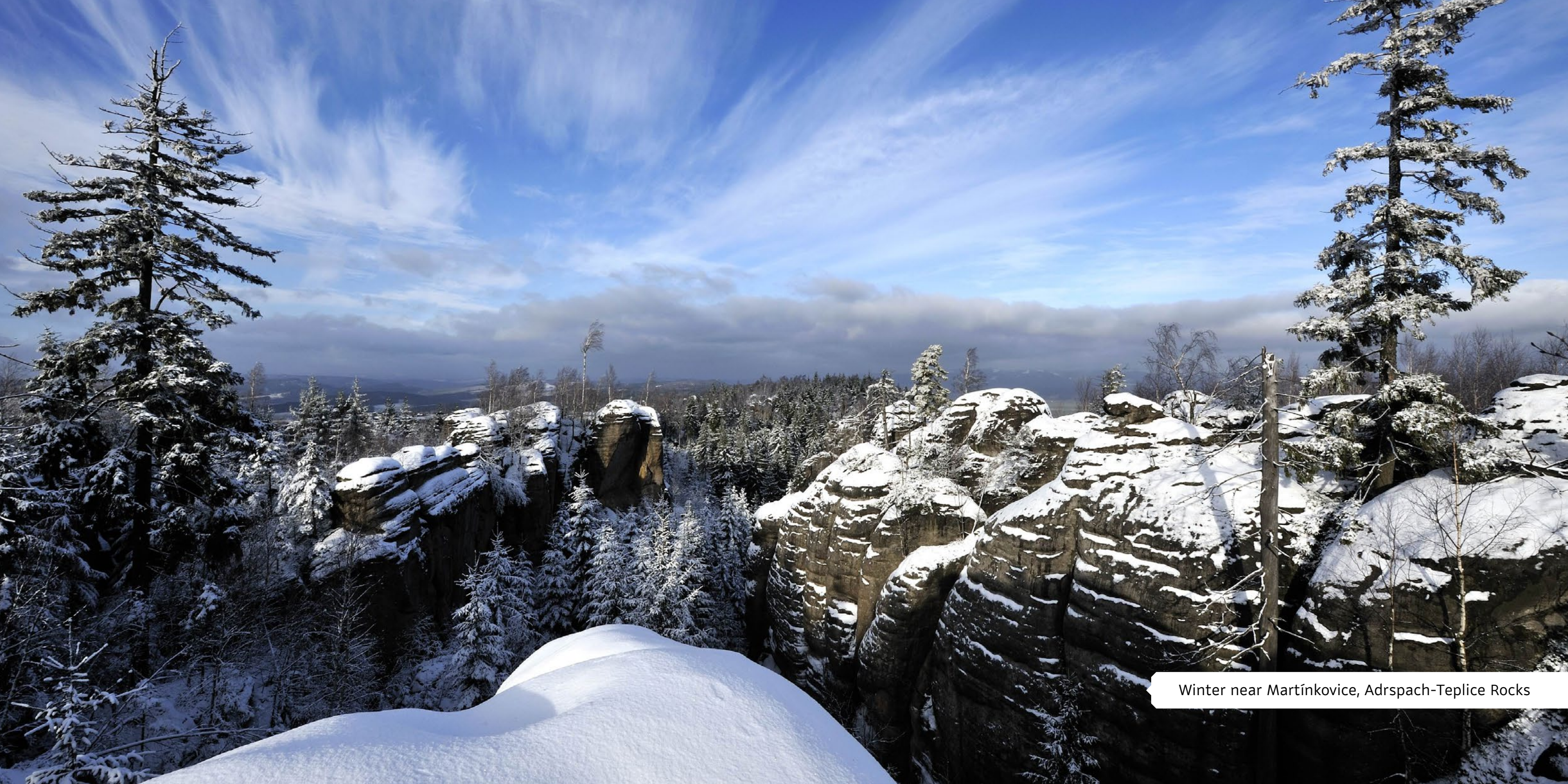
Winter near Martínkovice, Adrspach-Teplice Rocks